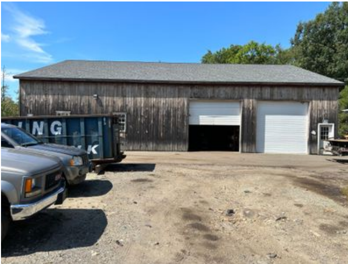
4,000 SF Shop