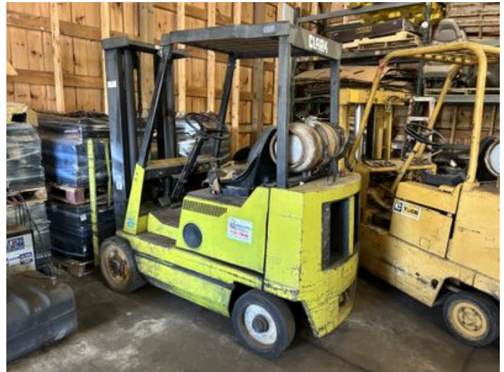
Cat and Clark Fork Lifts