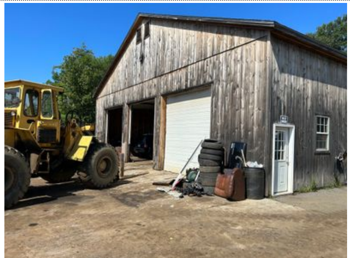
4,000 SF Shop