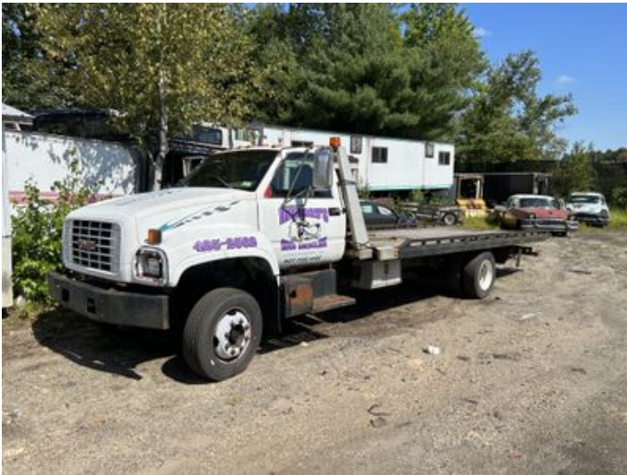
GMC 2 Car Carrier