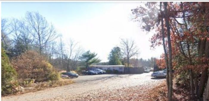
View from Road