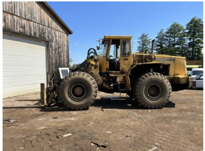
1992 Volvo L120 Front End Loader